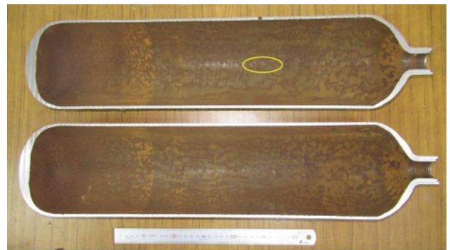
Internal surface of cylinder, showing corrosion over entire surface. Leak location circled.